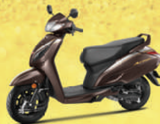
MATTE MATURE BROWN METALLIC

*+The technical specifications and design of the vehicle may vary according to the requirements and conditions without any notice • Activa 6G meets Bharat Stage VI norms • Product shown in the picture may vary from actual product available in the market • Accessories shown in the picture are not part of standard equipment • The technical specifications mentioned are for Deluxe variant • *Mileage has increased by 10% for Activa 6G BS-VI Deluxe variant as compared to the Activa 5G BS-IV Deluxe variant • All features may not be part of all variants • **Conditions apply.